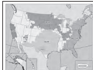
Figure 2. Geographic boundaries of currently recognized reservoirs for rabies in terrestrial mammals. http://www.cdc.gov/ncidod/dvrd/rabies/Epidemiology/Epidemiology.htm

Dean et al., 1996 & C. Hanlon et al., 1999). In cases where individuals are aware of an animal exposure with a known or suspected rabid animal, rapid and accurate laboratory testing of the animal, if the animal is available, allows hospital physicians to initiate timely Postexposure Prophylaxis (PEP). It is equally important to know that an animal is not rabid; expensive and extended rabies prophylaxis treatment can be eliminated. Even in instances where a laboratory diagnosis is delayed, once a negative rabies result is obtained, the PEP can be halted, preventing any further unnecessary medical treatment and its associated costs (Hanlon et al., 1999). The annual Compendium of Animal Rabies Prevention and Control (CDC, 2007) provides recommendations about the testing of animals suspected of rabies.